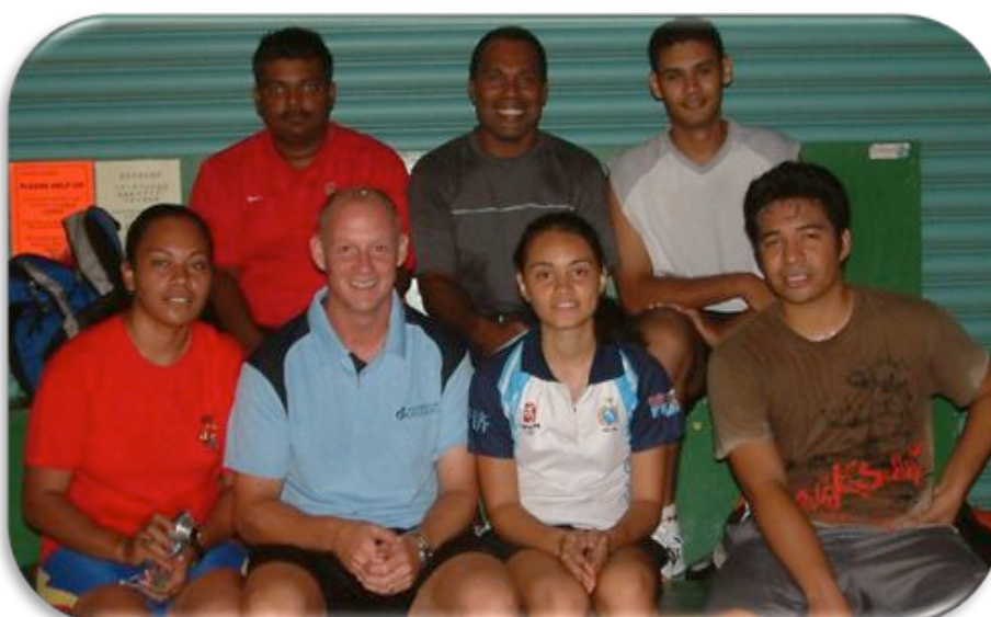
Pacific coaches attending 2009 Coaching Conference