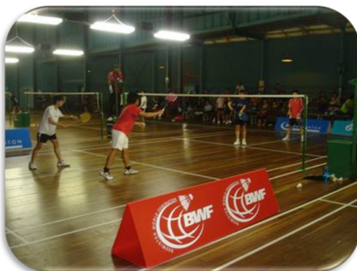
2009 Coaching Conference – Auckland, New Zealand

Without doubt, “development” in all senses of the word is the springboard to our future success. Each piece of the badminton puzzle must be mapped out and have a pathway forward if we are to compete on the international stage.