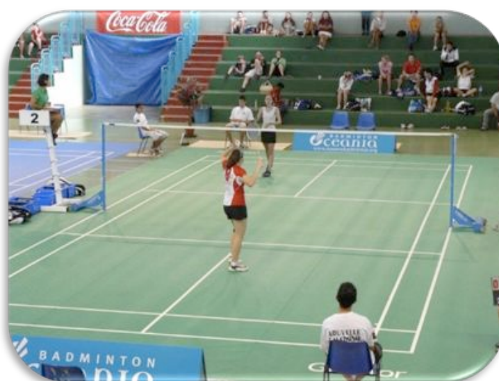
Noumea International 2009 Womens Singles Final